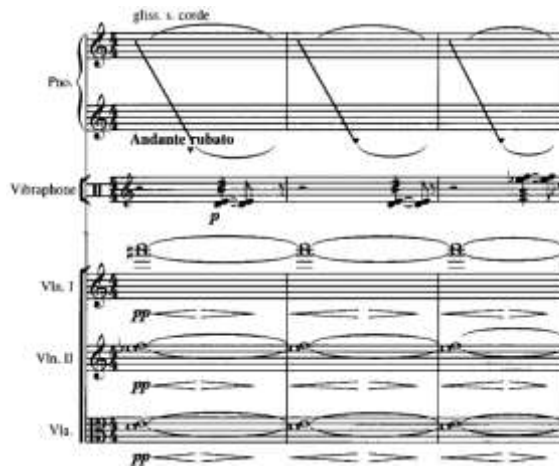
Example 6. Mormorando effects, mm. 403-405, p. 67 (piano, vibraphone, violin 1, violin 2 and viola)

The recapitulation is a tour de force of the soloist: it contains mormorando effects in the saxophone tube, on the pedal notes of the strings and glissando on the piano strings, which prepare a short cadence spectacularly achieved solely through multiphonics: